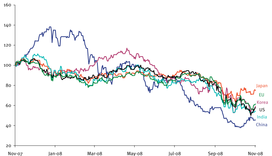
Technology Stock Indices (12 months ending Nov 2008)

China Information Security Technology Inc , through its wholly-owned subsidiary China Public Security Holdings Ltd , has acquired Shenzhen Zhongtian Technology Development Company Ltd , a China-based provider of hospital digital information systems, for US$16.5m of which US$9.9m is cash and the remaining US$6.6m is payable in January 2009. November 5, 2008