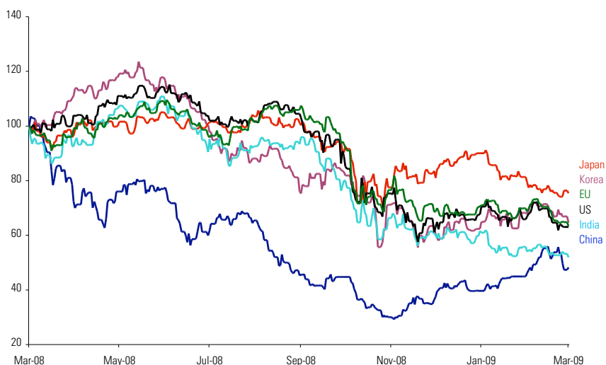
Technology Stock Indices (12 months ending Mar 2009)

CDC Software , a Chinese software company, will acquire WKD Solutions Ltd , a UK-based business process solutions company, for an undisclosed