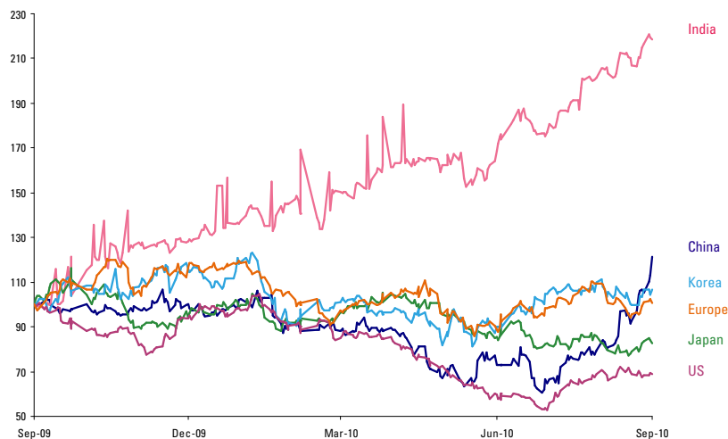
Chemical Stock Indices for Selected Countries (12 months ending 10Sep10)

Air Liquide , a French producer of cryogenic liquids and gases, has signed a long-term contract with Nanjing CEC Panda LCD Technology to provide them with ultra high purity gases. Air Liquide will build a